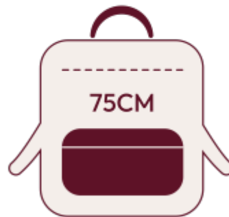
1 x small carry-on bag (backpack or handbag)

If you have more luggage, please make arrangements to store it prior to joining the tour. We are unable to carry extra luggage on the mini-coach.