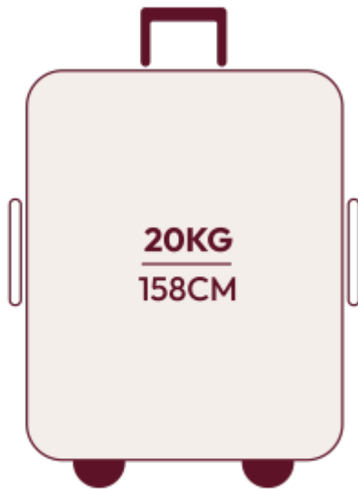
1 x suitcase

As we travel in mini-coaches, luggage space is limited. Here's what you can take with you on tour: